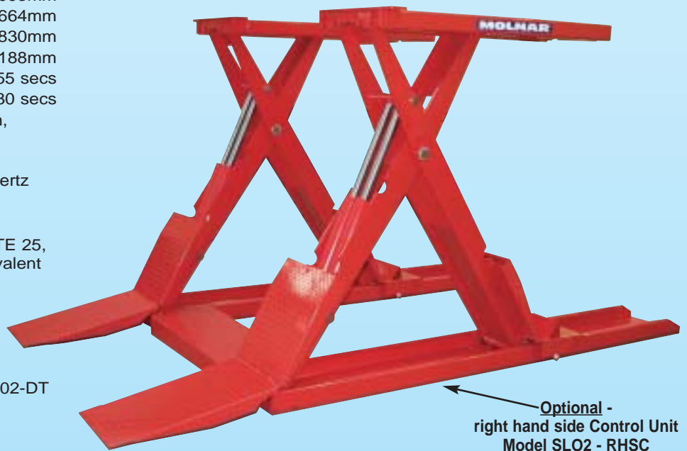
Optional - right hand side Control Unit Model SLO2 - RHSC

The Manufacturer reserves the right to alter these features and specifications without notice.