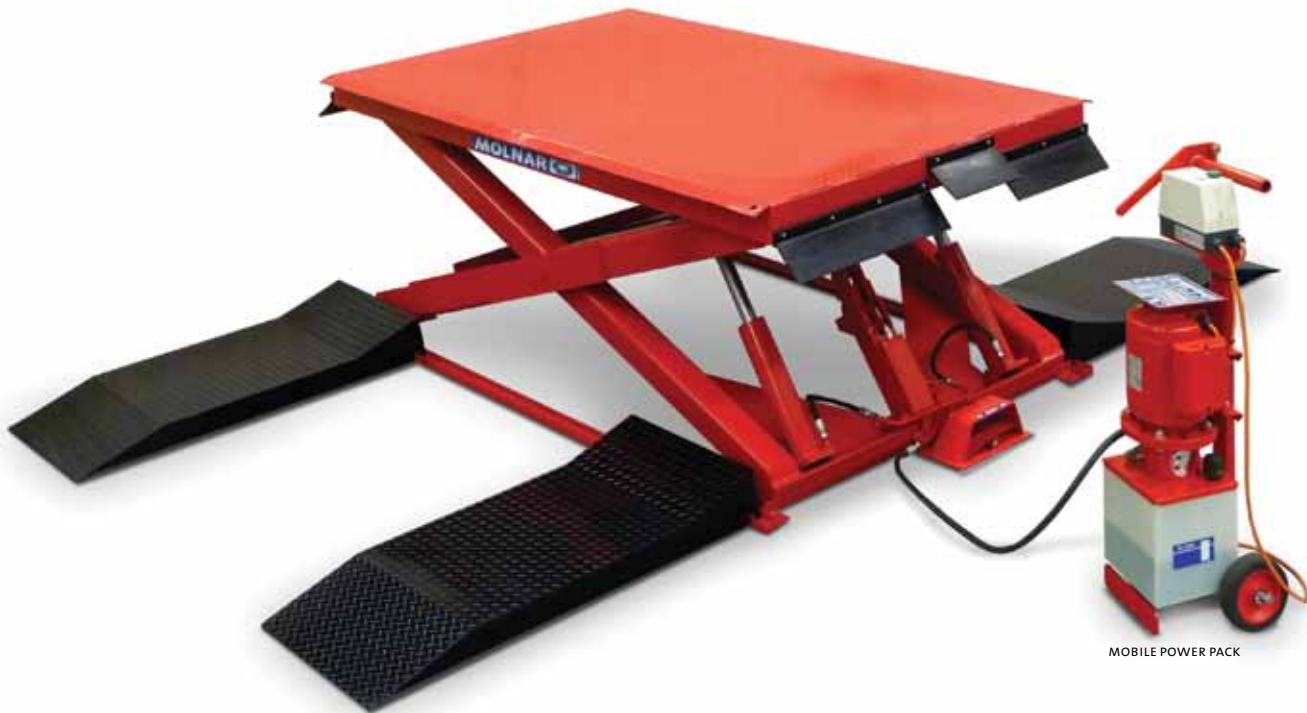
MOBILE POWER PACK

The Platform Lift is a small, low profile platform hoist designed specifically for fast turnaround on wheel and tyre work. Extra long run-up ramps make this product suitable for low clearance vehicles.